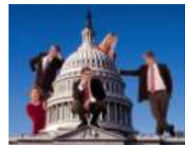
It's political satire for a good cause at The Music Hall on Jan. 31 with the Capitol Steps.